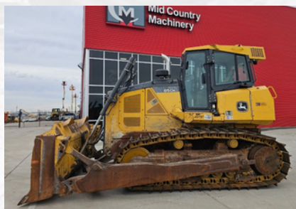
2015 850K XLT