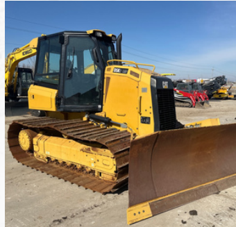
2019 D5K2 LGP