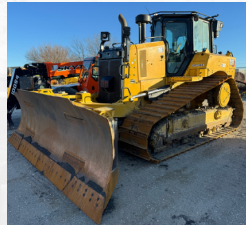
2021 D6 LGP