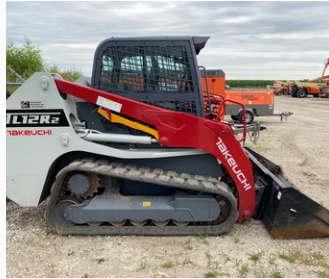
2022 TL12V2 CRHR